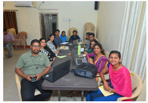
Students participation in Seminars held by the branch for members